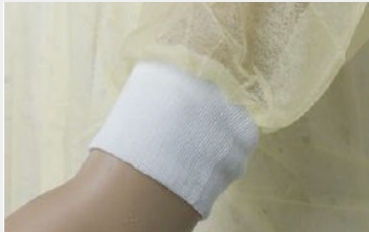
LONG SLEEVE, KNITTED CUFFS