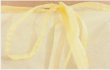
TIE ON THE BACK NECK