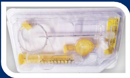
NR-FIT Epidural Kit I