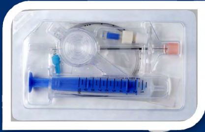
Mini Pack System I