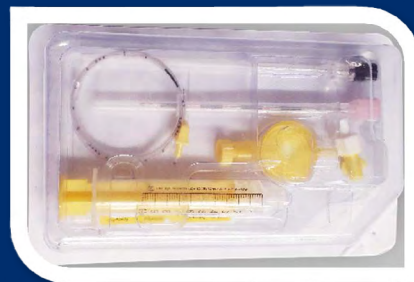
NR-FIT Combined Spinal Epidural Kit II